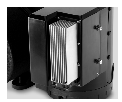
Removable Electric Box Can be remote mounted.