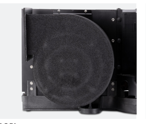
DC Blower Includes a high static DC blower.