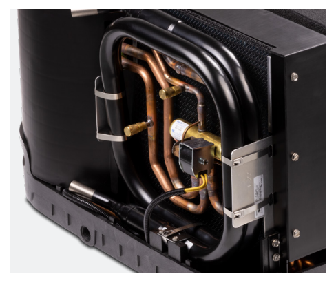
Titanium Condenser Robust Design.