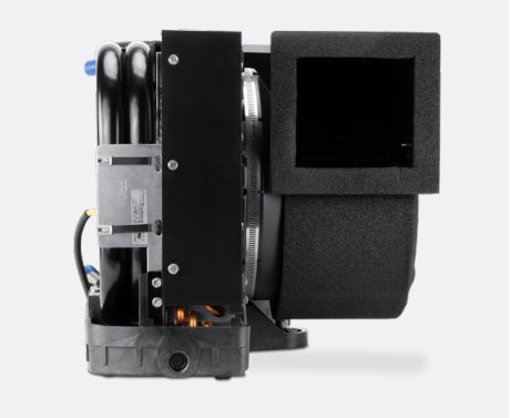
Compact Size Retro-fittable for Turbo units.