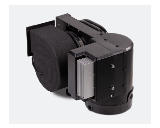
Variable Capacity GVTX variable capacity Turbo unit available in two size options that will provide cooling from

Traditional air conditioners and heat pumps are subjected to numerous hard starts over the life of the equipment, which places a great deal of stress on critical internal components. Running longer cycles at lower speeds reduces the number of times the system must hard start. Over time, this can help extend the service life of the equipment.